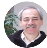
Ariel Levenson Center for Nanoscience and Nanotechnology CNRS / Université Paris-Saclay